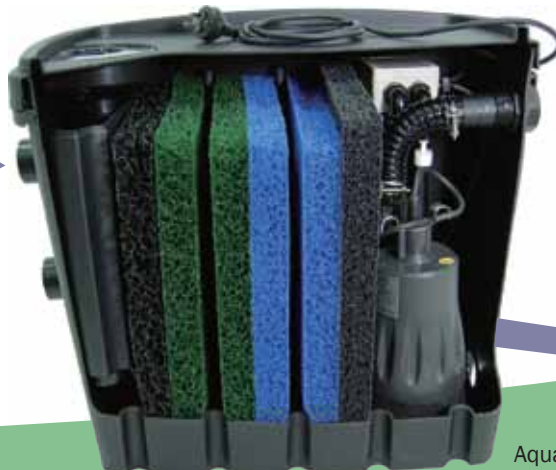
Aqua2use GWDD shown

Lint and other impurities are intercepted, and the graywater is filtered through a progressive filtration technology without using any chemicals.